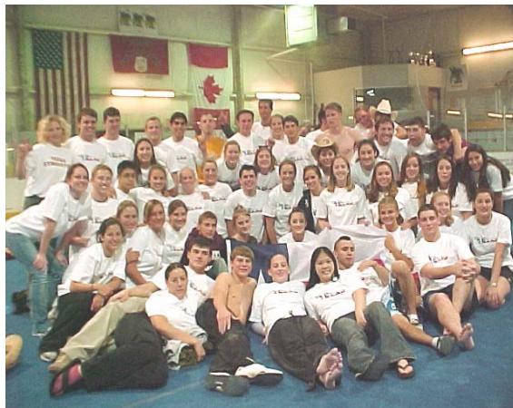
Texans at the 2005 NAIGC Championships

This year, every gymnast from Texas wore a "We're Texas" t-shirt at the finals competition. These shirts were handed out to the gymnasts at the Texas Gymnastics Conference (TGC) meet held at Texas A&M on April 2nd. Congratulations to the Lady Longhorns on their National victory.