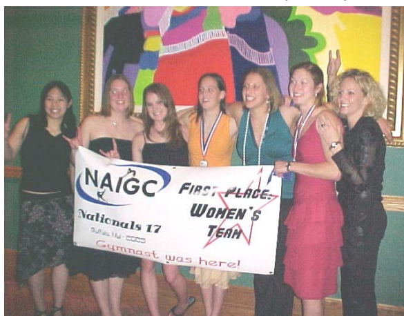
The University of Texas National Champions